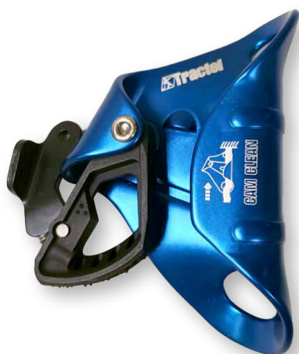
Tractelift® Belt Grab